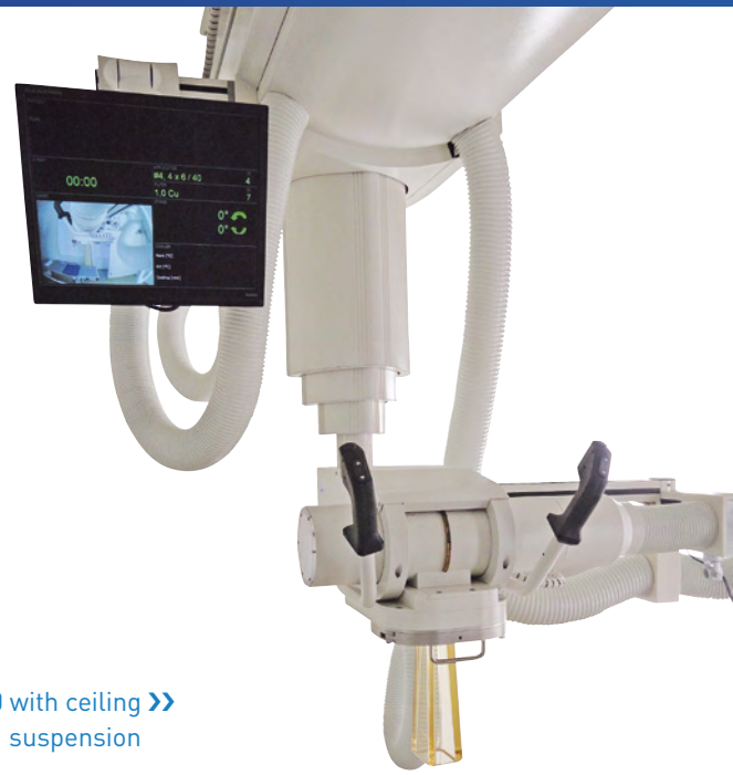
T-200 with ceiling >> suspension